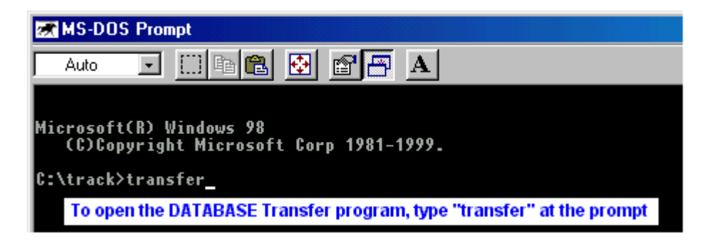
(Click the ENTER key)

User, NOTE: Before all else, print the DATABASE doc file and read it thoroughly.